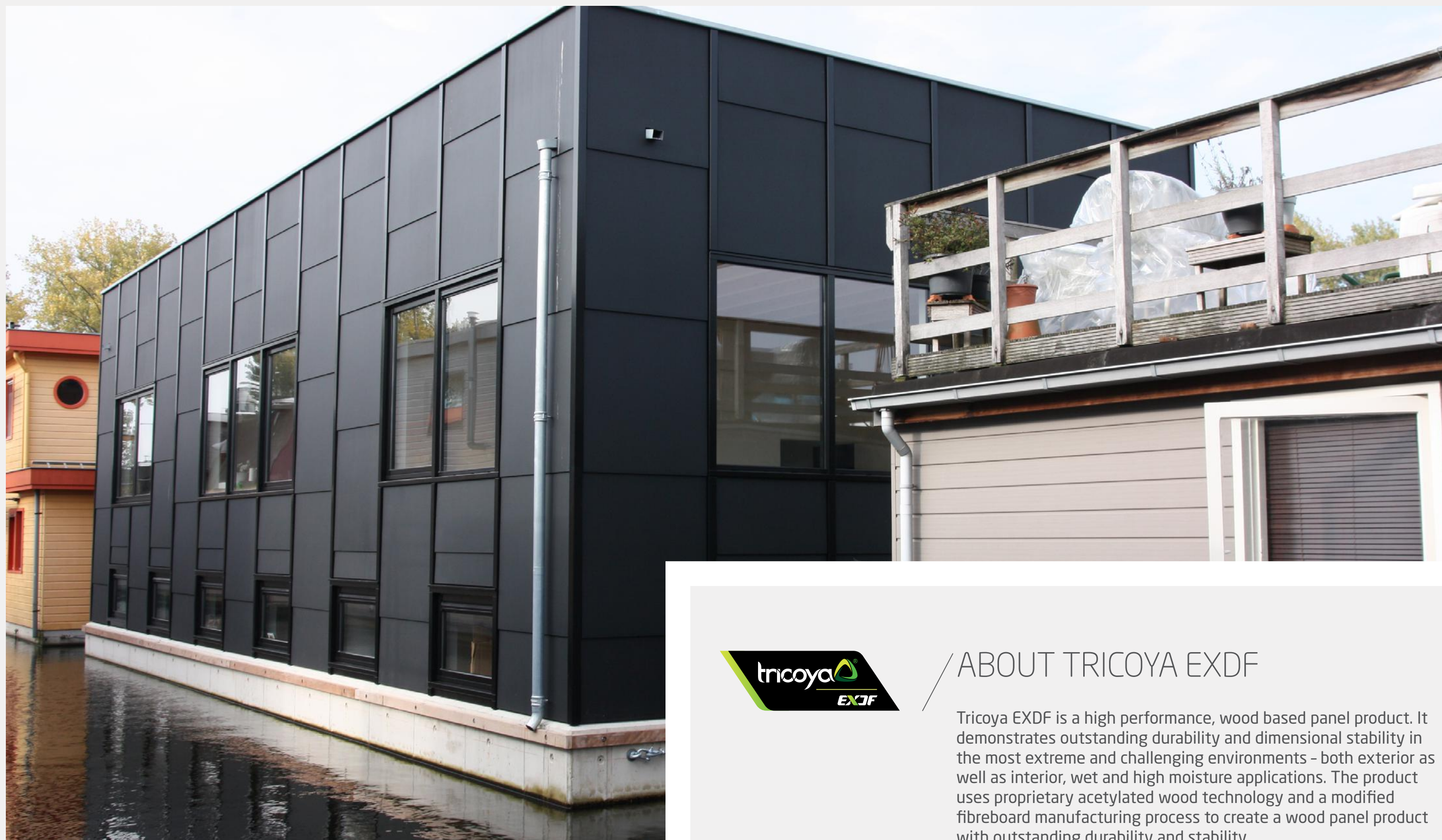
MEDITE TRICOYA EXTREME